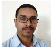
By: M.R. Lahu