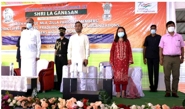
IT News Imphal, June 24:

Governor of Manipur La. Ganesan has appealed people to enroll themselves through various Schemes which are being taken up by the Centre and the State and get the benefits. He was speaking at an interaction programme of Zilla Parishad Members, District Level Officers, Pradhans, Civil Society Organisations and villagers held today at Thiyam